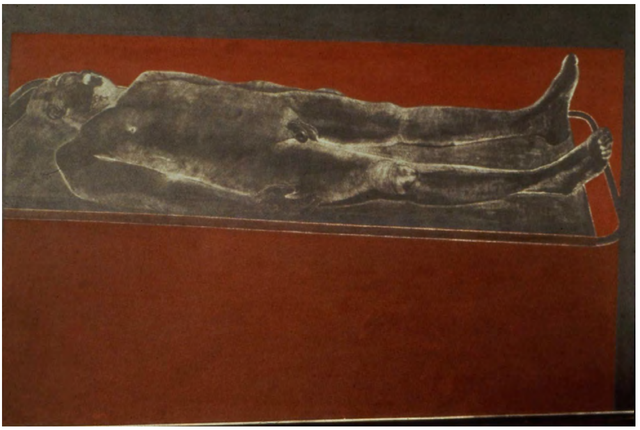
Elegy for Steve Biko

enshrined in every textbook commemorating South African "Resistance Art"). <sup>3</sup> Christian references are embedded in many of Stopforth's famous anti-apartheid works, such as Elegy for Steve Biko from 1981 which shows the charismatic leader of the Black Consciousness Movement stretched out naked on a mortuary tray after his horrific death on 12 September 1977 from brain damage suffered during police detention.<sup>4</sup> The picture cannot be reduced to the inflections of the many "Dead Christ" paintings it brings to mind (including iconic paintings by Holbein and Mantegna), but the associations help to cement this visualization of Biko's martyrdom. Christian symbolism is an important thread in anti-apartheid art